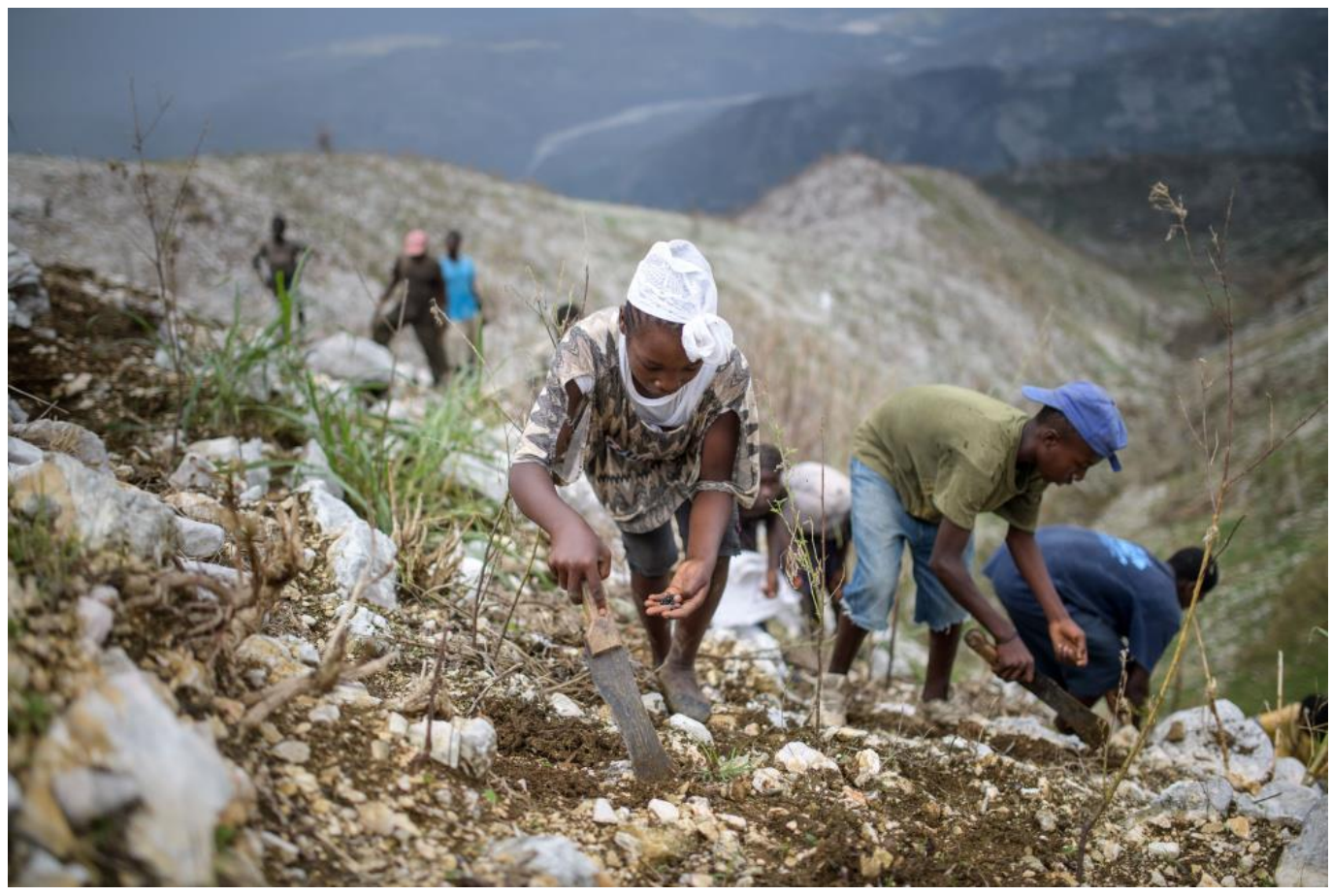
Above: A family planting bean seeds in a very steep slope in the village of Despagne near Jeremie in Haiti.

Everyone should have access to quality and secure employment, access to labour markets with equal opportunities, and a fair share of the benefits of economic growth. The link between decent work and development has come to the fore as one of the most effective ways to ensure that the benefits of development are shared.148