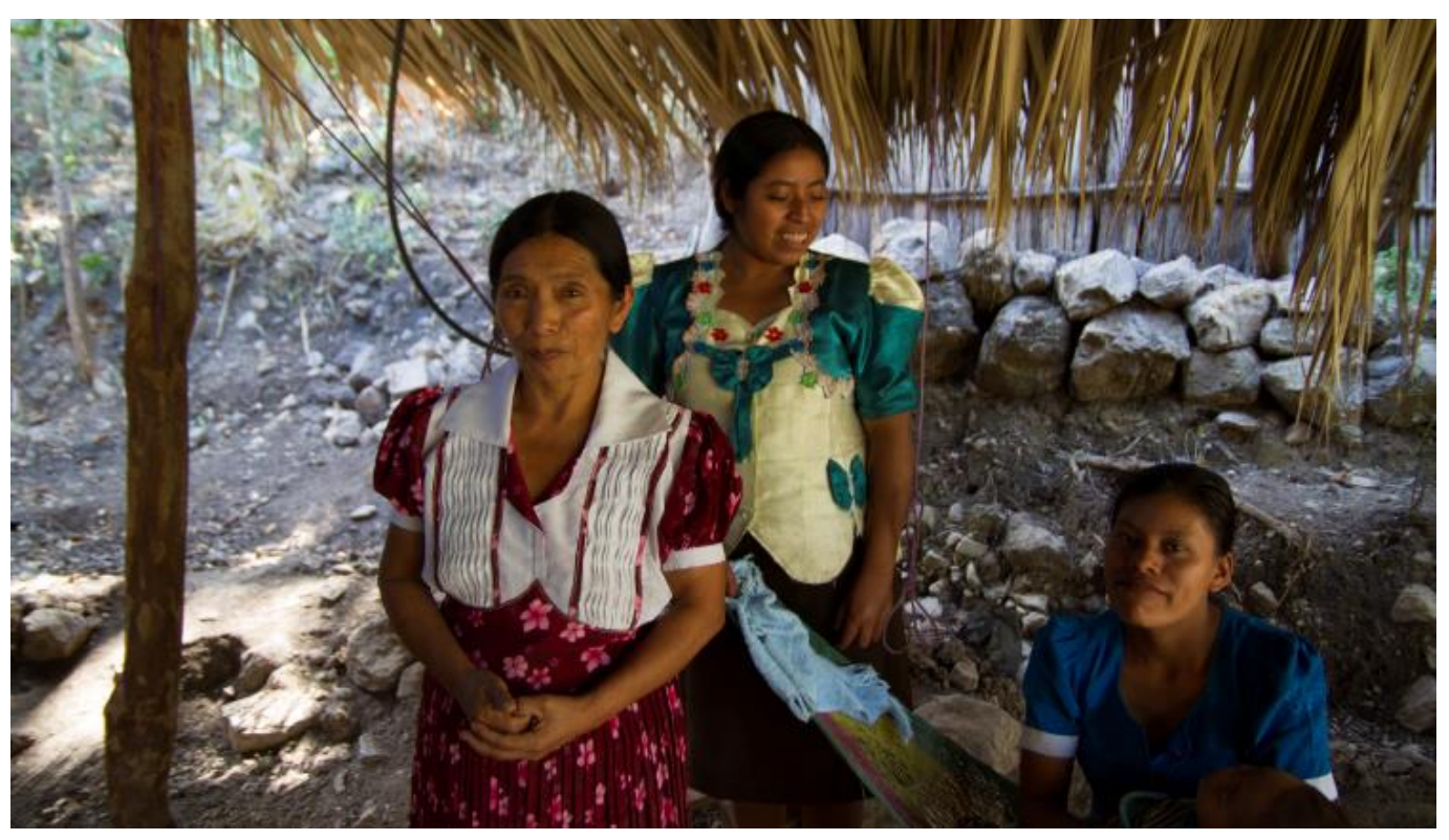
Above: Members of the Ch'orti' communities in Guatemala.

Latin America and the Caribbean is a racially and ethnically diverse region. There are at least 44.8 million indigenous people and 150 million of African descent,22 together representing over 30% of the region's population.23 Indigenous populations are largest in Mexico, Peru, Bolivia and Guatemala,24 and there are approximately 420 indigenous languages spoken in the region.<sup>25</sup> In Latin American countries such as Brazil, Venezuela and the Dominican Republic, more than half the population is black.26