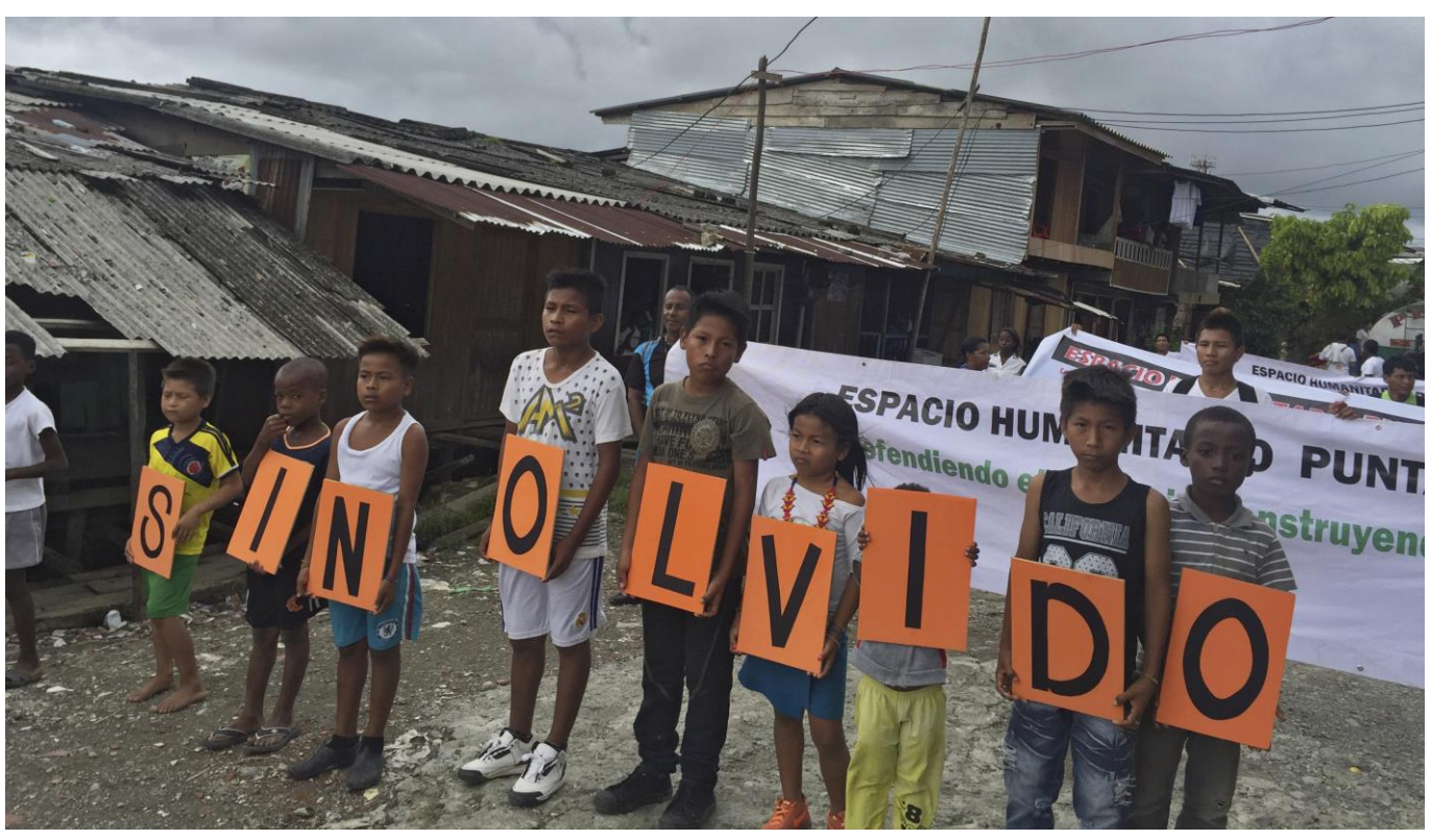
Above: Indigenous and Afro-descendent children at the event marking the extension of the 'humanitarian space' in Buenaventura to include the community port of Punta Icaco. They hold up a sign which translates as 'Lest we forget', referring to the history of human rights violations

Inequality is not simply about income maldistribution, but is primarily an issue of who controls power. Using macroeconomic indicators for measuring inequality is deficient, because it does not capture this. The abuse of power has led to major corruption scandals in Brazil, Honduras and Guatemala, triggering widespread protests. And yet instead of reform, these led to crackdowns and shrinking civil society space. This provides a stark warning about rising populism or increasing support for less democratically minded leaders in Latin America and the Caribbean. Unless reforms are carried out, it is likely that the region's electorate will vote not just for a comedian like Jimmy Morales (in Guatemala), or force a postponement of the vote, as occurred in Haiti, but more worryingly vote into power candidates like Donald Trump in the US or Rodrigo Duterte in the Philippines. This suggests that the region has much work to do to fulfil SDG 16: 'Promote peaceful and inclusive societies for sustainable development, the provision of access to justice for all, and building effective, accountable institutions at all levels'.60