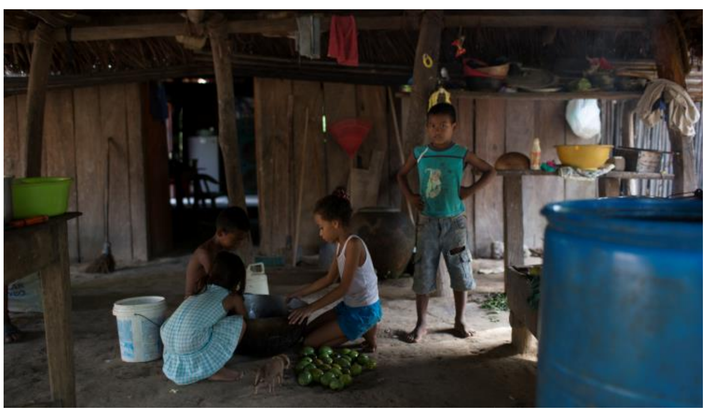
Above: A typical family home in Buenos Aires, Colombia. Christian Aid partner Corambiente screens children and provides deworming medicine and food supplements.

Life chances in Latin America and the Caribbean are very much bound up with where you are born and your identity, including gender, ethnic group, race, faith or sexuality. Income inequality is one part of the picture, but there are huge gaps in access to basic services (healthcare and education), in social security (pensions and maternity cover), and in access to employment or markets to sell produce. Women suffer disproportionally from the effects of poverty, marginalisation, climate change, discrimination and violence.