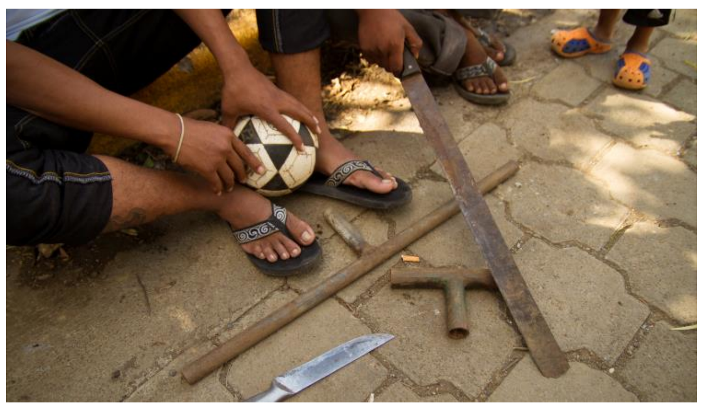
Above: Young men display their home-made weapons in a deprived neighbourhood of Managua.

Ending violence is a key objective within the SDGs.99 For example, Goal 5.2 seeks to 'Eliminate all forms of violence against all women and girls in the public and private spheres, including trafficking and sexual and other types of exploitation'.