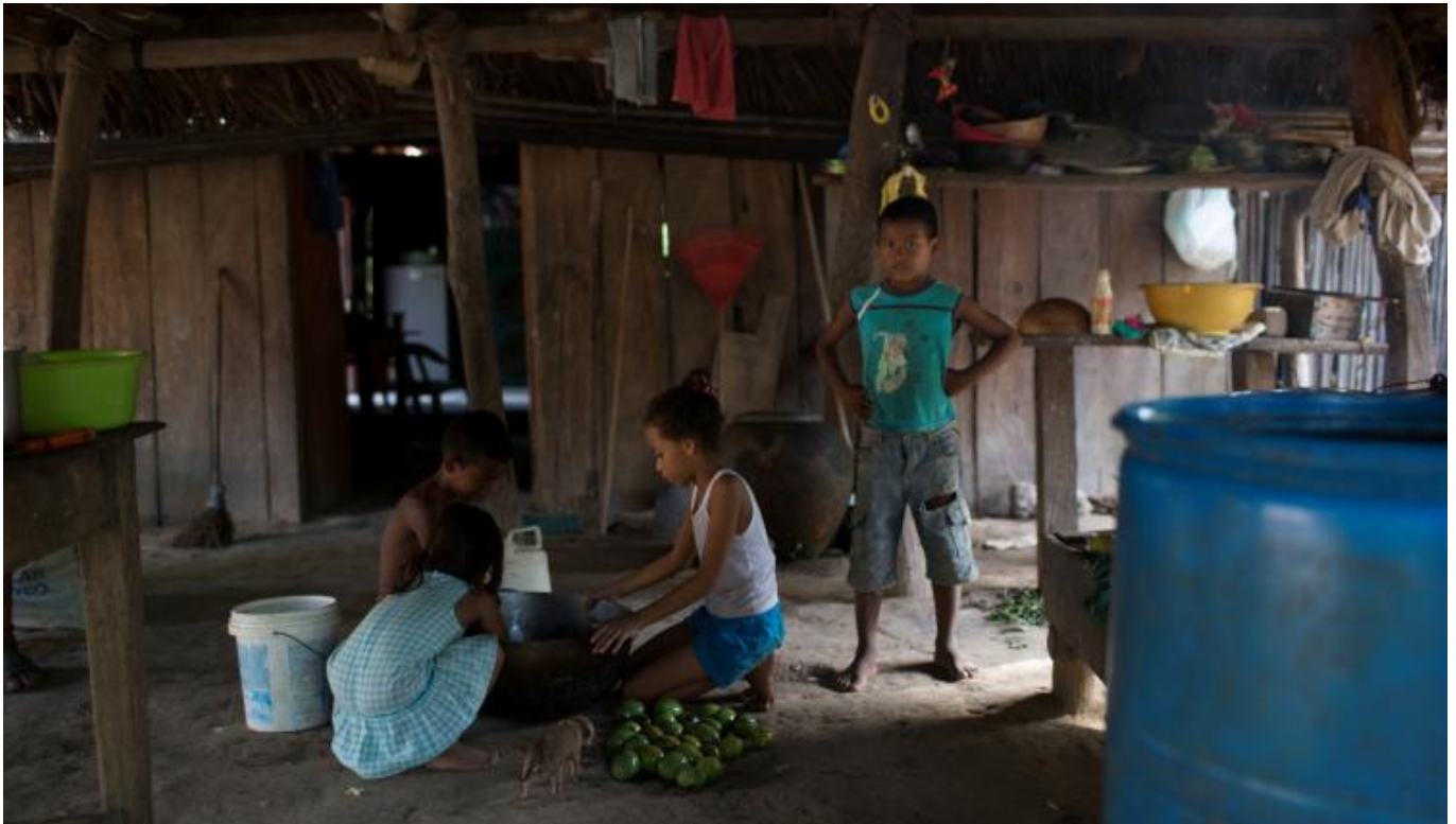
Above: A typical family home in Buenos Aires, Colombia. Christian Aid partner Corambiente screens children and provides deworming medicine and food supplements.

Life chances in Latin America and the Caribbean are very much bound up with where you are born and your identity, including gender, ethnic group, race, faith or sexuality. Income inequality is one part of the picture, but there are huge gaps in access to basic services (healthcare and education), in social security (pensions and maternity cover), and in access to employment or markets to sell produce. Women suffer disproportionately from the effects of poverty, marginalisation, climate change, discrimination and violence.