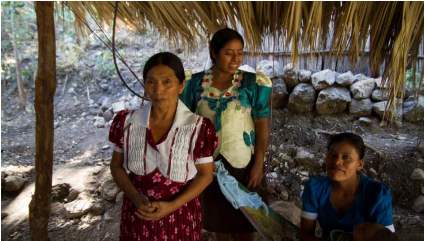
Above: Members of the Ch'orti' communities in Guatemala.

Latin America and the Caribbean is a racially and ethnically diverse region. There are at least 44.8 million indigenous people and 150 million of African descent, 22 together representing over 30% of the region's population. 23 Indigenous populations are largest in Mexico, Peru, Bolivia and Guatemala, 24 and there are approximately 420 indigenous languages spoken in the region. 25 In Latin American countries such as Brazil, Venezuela and the Dominican Republic, more than half the population is black. 26