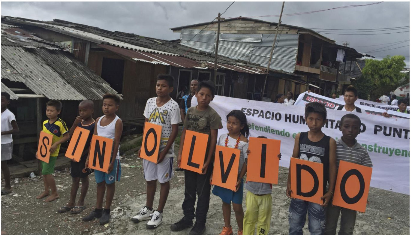
Above: Indigenous and Afro-descendent children at the event marking the extension of the 'humanitarian space' in Buenaventura to include the community port of Punta Icaoco. They hold up a sign which translates as 'Lest we forget', referring to the history of human rights violations

Inequality is not simply about income maldistribution, but is primarily an issue of who controls power. Using macroeconomic indicators for measuring inequality is deficient, because it does not capture this. The abuse of power has led to major corruption scandals in Brazil, Honduras and Guatemala, triggering widespread protests. And yet instead of reform, these led to crackdowns and shrinking civil society space. This provides a stark warning about rising populism or increasing support for less democratically minded leaders in Latin America and the Caribbean. Unless reforms are carried out, it is likely that the region's electorate will vote not just for a comedian like Jimmy Morales (in Guatemala), or force a postponement of the vote, as occurred in Haiti, but more worryingly vote into power candidates like Donald Trump in the US or Rodrigo Duterte in the Philippines. This suggests that the region has much work to do to fulfil SDG 16: 'Promote peaceful and inclusive societies for sustainable development, the provision of access to justice for all, and building effective, accountable institutions at all levels'. 60