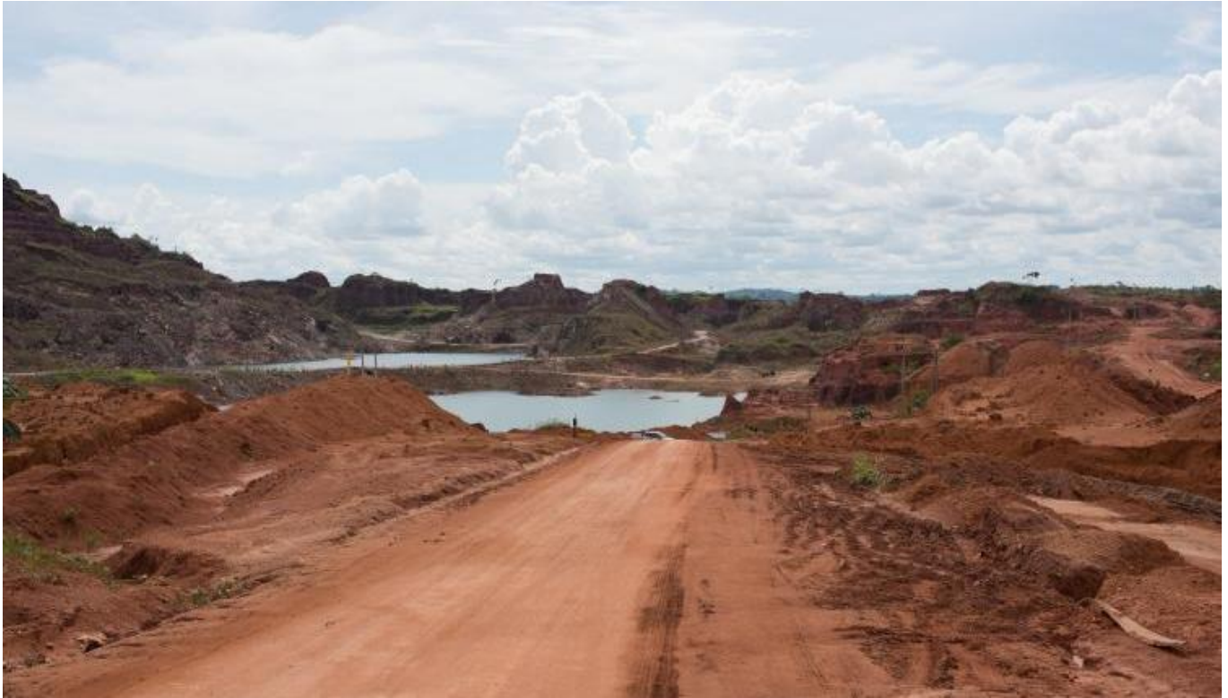
Above: A mine site in Ariquemes, Rondônia state, Brazil. Mining, cattle ranching and soya cultivation have resulted in Rondônia becoming one of the most deforested places in the Amazon, and caused tensions and violence between the migrant and indigenous populations.

Former UN Secretary-General Ban Ki Moon, among others, has acknowledged that climate change is the ‘defining issue of our time.’ In his report, Progress Towards the Sustainable Development Goals , he states that: ‘Climate change presents the single biggest threat to development, and its widespread, unprecedented impacts disproportionately burden the poorest and most vulnerable. Urgent action to combat climate change and minimize its disruptions is integral to the successful implementation of the Sustainable Development Goals.’ 169