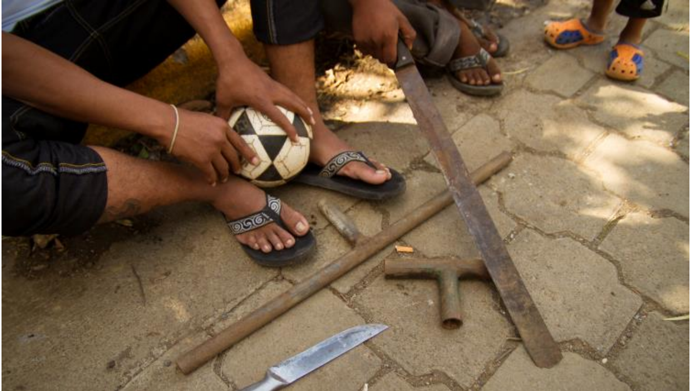
Above: Young men display their home-made weapons in a deprived neighbourhood of Managua.

Ending violence is a key objective within the SDGs. 99 For example, Goal 5.2 seeks to ‘Eliminate all forms of violence against all women and girls in the public and private spheres, including trafficking and sexual and other types of exploitation’.