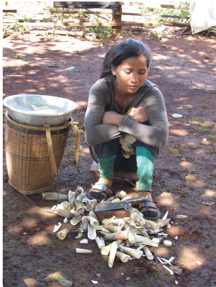
Indigenous woman from mining affected area

In Pu Tung (or Prey Meas village) and Pu Hung village the companies operating were (1) Rong Cheng Industrial Investment (Cambodia) Co. Ltd, (2) Oz Minerals (Cambodia) Ltd, (3) Oxiana (Cambodia) Ltd and (4) Zhong Xin Industrial Investment (Cambodia) Co Ltd. Additionally in Pu Hung village the companies present were (1) Cambodia Tonle Sap International Investment Co Ltd, (2) D and Z Investment Co Ltd, (3) Anqing Cambodia Investment Co, (4) China Forwin International Investment, and (5) Southern Gold Cambodia.