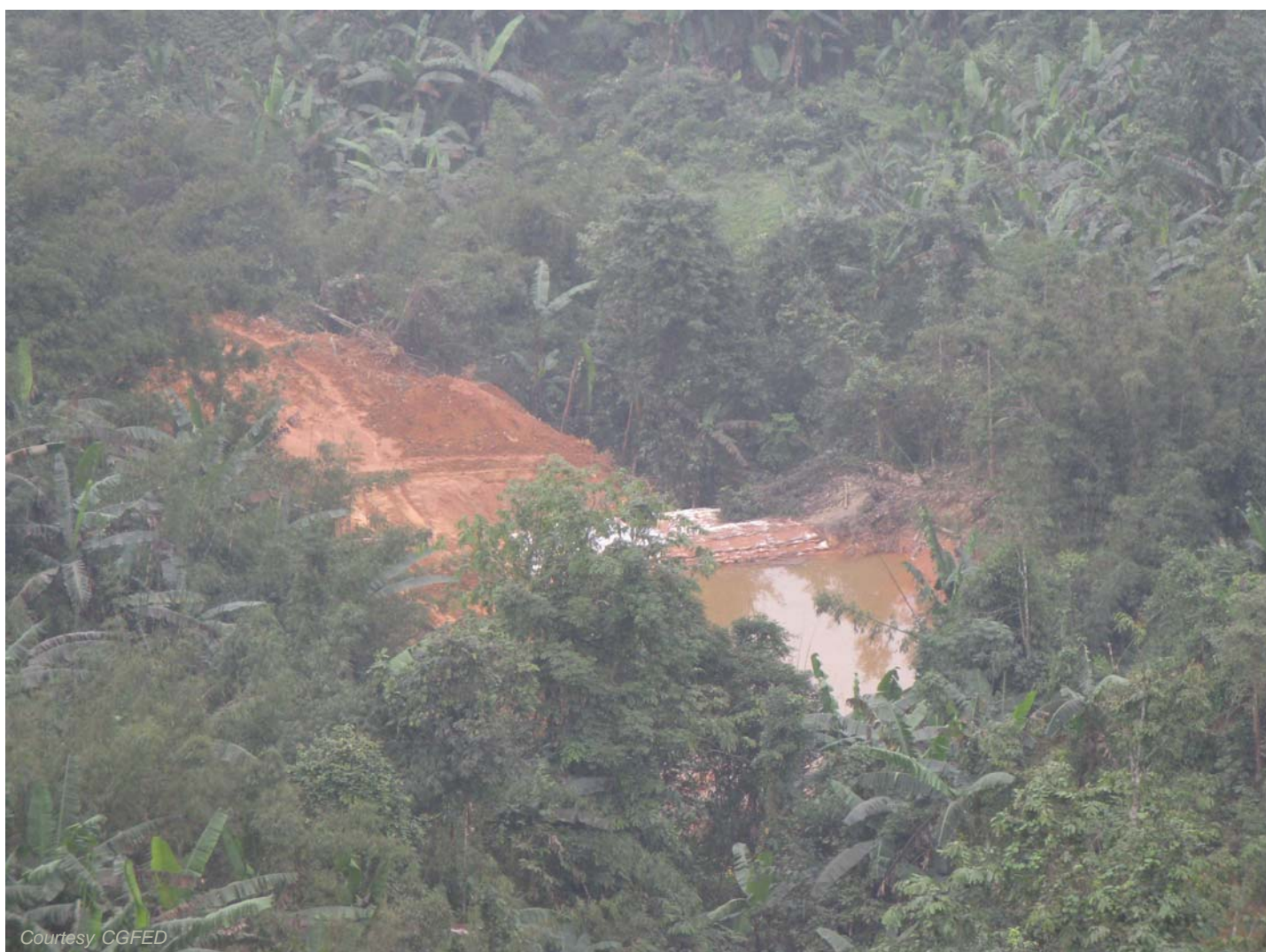
View of the mine in Hung Thinh commune, Tran Yen district, Yen Bai province, Vietnam

In the case of mining, State can acquire lands for implementing investment projects on mineral exploration and exploitation in accordance with legal regulations on investment and mining. Subject to environment protection requirements or land use plans the business or service bases need land for relocation (bases are not allowed to be in industrial zone, high-tech zone or economic zone). The process for acquisition, rehabilitation and compensation is the same as followed for other industries, with the Land Law 2003 being the main legislation supported by its decrees and decisions.