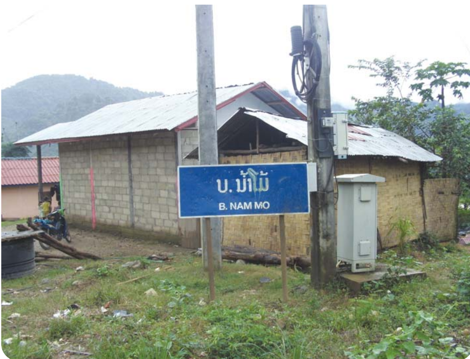
A mine site in Phu Bia mining project, Vientiane province, Lao PDR

Khouangvichit's study(2010)covered the issue of compensation of project affected communities in the Sepon