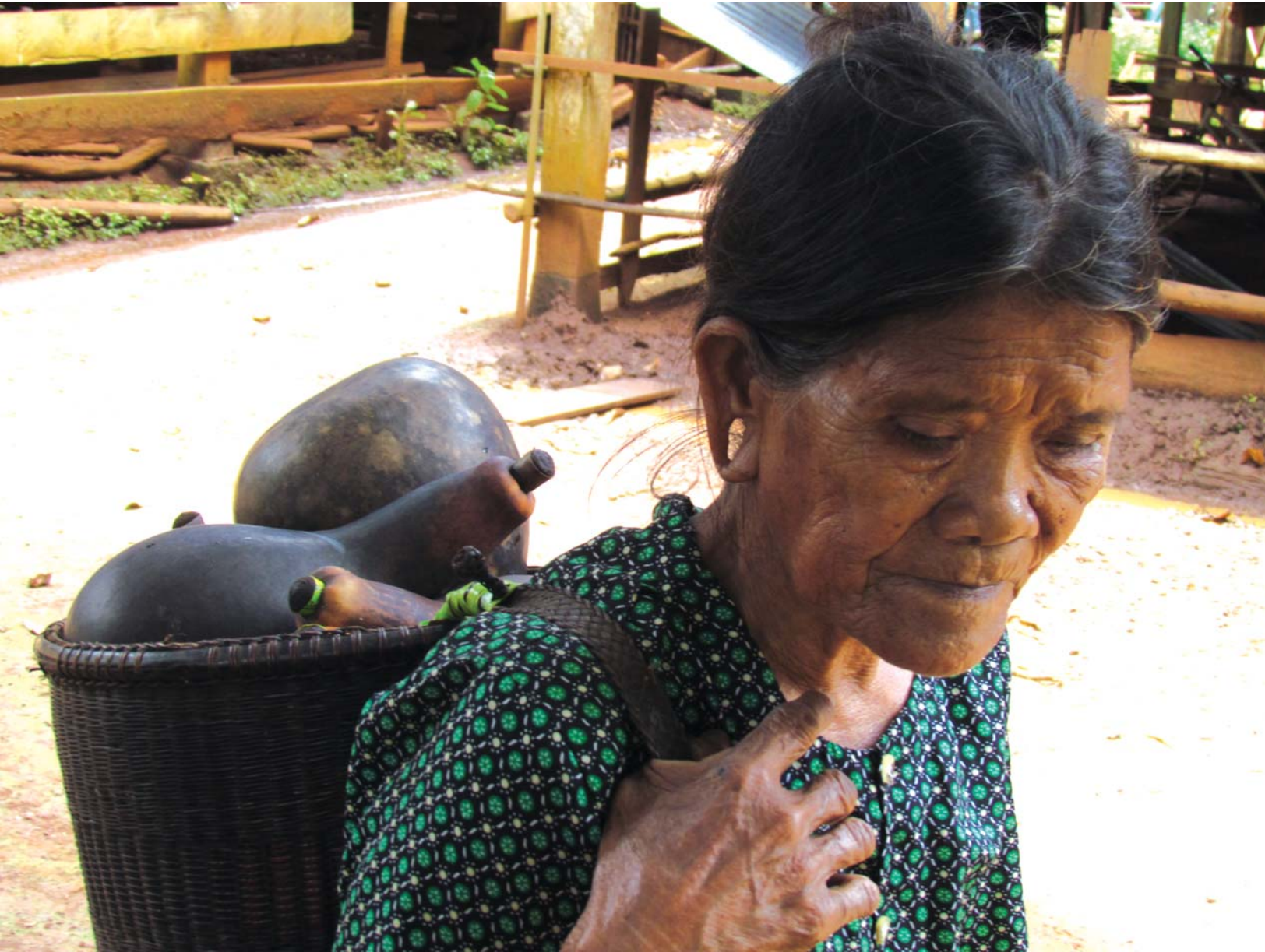
Indigenous woman sharing her concerns on proposed mining