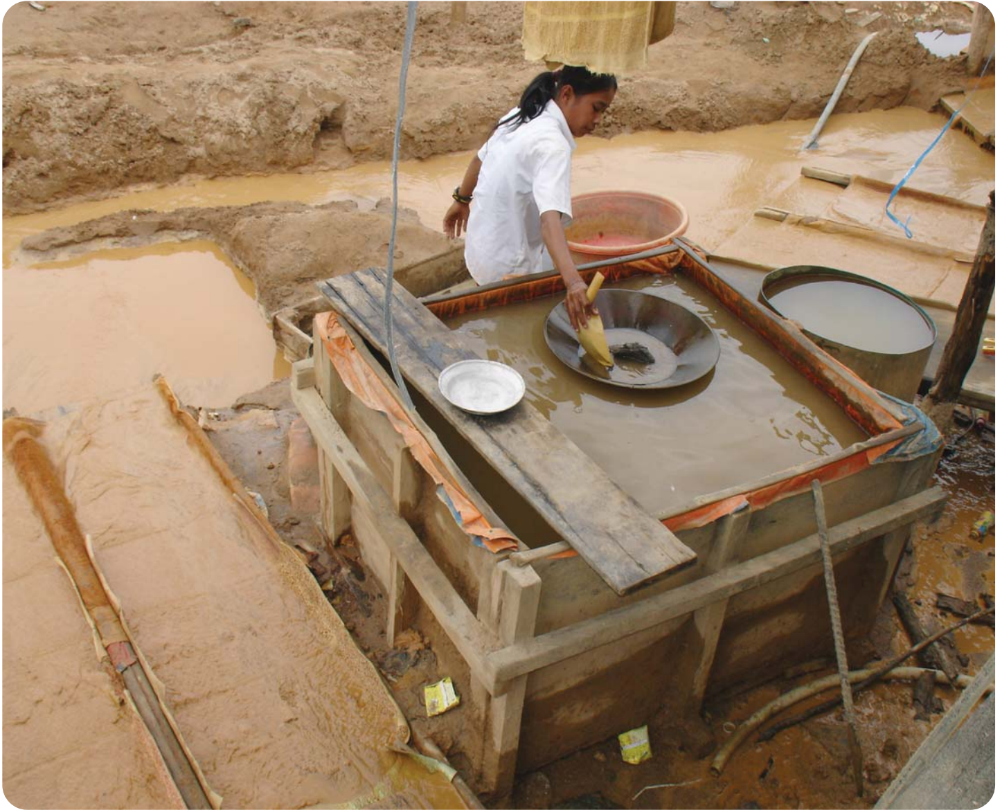
Adolescent migrant worker in small-scale gold mines, Chong Plas, Mondulkiri province, Cambodia