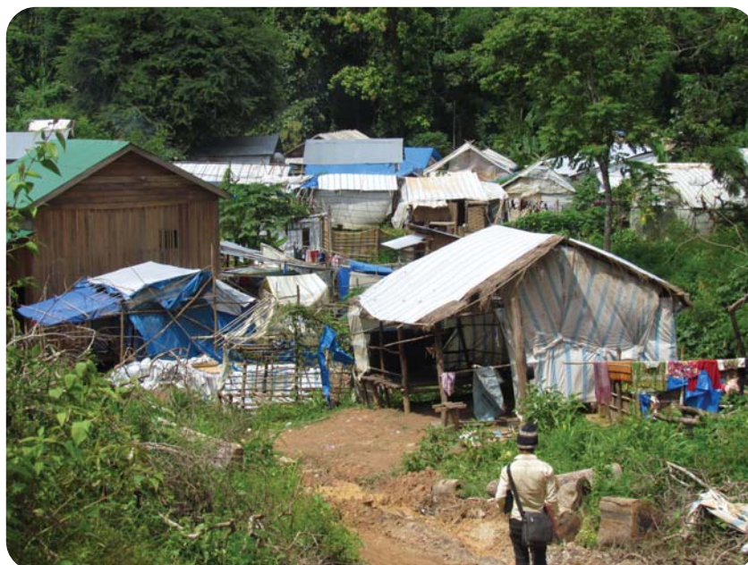
A migrant settlement around the small-scale gold mines, Chong Plas, Mondulakiri province, Cambodia

The Land Law 2001 defines an indigenous community as “a group of people who are resident in the territory of the Kingdom of Cambodia whose members manifest ethnic, social, cultural and economic unity and who practice a traditional lifestyle, and who cultivate the lands in their possession according to customary rules of collective use” (Article 23). Indigenous people consisting of 36 different ethnic minority groups are only 3.5% of the country’s population. The lands of indigenous communities are protected under different laws relating to land, forests and natural resources. Legally, they include not only lands actually cultivated but also reserved land necessary for shifting cultivation which is the traditional agricultural practice of these communities and which is recognised by the administrative authorities (ADB 2007). There are at least three types of traditional ancestral land use namely, areas used for agriculture and NTFP collection, areas used for cemeteries, and the third, sacred forests (FAO 2010). Indigenous people can claim both individual and collective land titles that include residential land, agricultural land or land kept as reserve under the traditional agricultural rotation system and in some cases areas of forest land within boundary of agricultural land (ADB 2007).