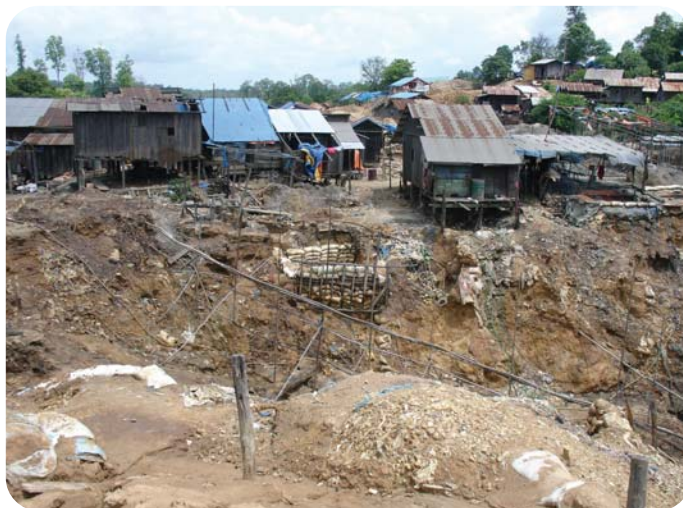
Gold mining site, Putong in Chong Plas commune, Monduliri province of Cambodia

Pu Hung village, Monduliri province, is at a distance of 15 km from the mine site where gold mining is taking place. The Punong indigenous community who live here has been experiencing impacts due to artisanal mining activities in the area for some time now. Traditionally, the community had been involved in artisanal gold panning but over a period of time, the lure of gold brought in contractors and miners from the outside, displacing the local community. Therefore, the members of this community no longer pan for gold, though located around the mines, but practice farming and forestry. Small-scale mining which is mostly illegal in nature and spreads as rat-holes wherever they strike gold, has occupied indigenous peoples' farm lands. Farmers have lost land, resin trees and hill-slope farms due to which they have had to change their cropping pattern and shift to selling vegetables to the gold miners in order to survive. Fishing,