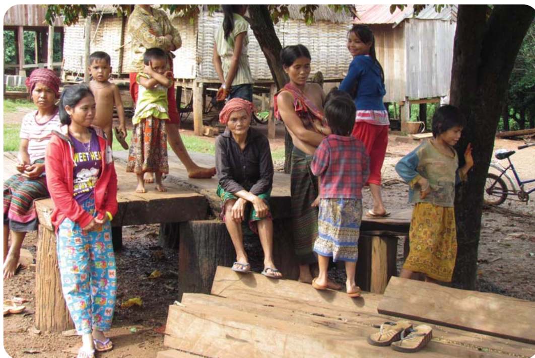
An indigenous community share their anxieties over exploratory activities by mining companies

Earlier, the company that was given the license to grow rubber plantations used high levels of chemical pesticides and this was opposed by the indigenous community as they always practiced natural farming. Now they fear that their land and water bodies are polluted by these chemicals.