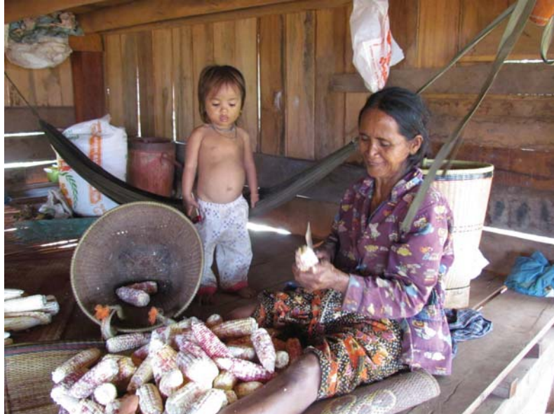
An indigenous woman expresses her fears if mining companies take their lands

In Mondulkiri province, the communes of Senmonorum, Dak Dam and Chong Plas were selected where gold and bauxite mining are underway and proposed. The villages of Pu Tang, Pu Treng, Pu Tung (Prey Meas or O Kloi areas) and Pu Hung were selected each covering around 20 participants. In Ratnakiri, Karchong, Malik, Lum Chor and Kok communes were selected and interviews and focus