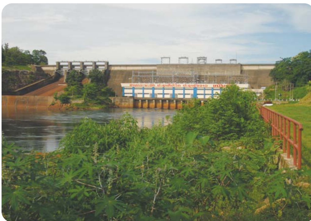
The controversial Nam Ngum hydel project built for fast track development of Lao PDR, including mining projects

Women get less training opportunities than men in all three mining projects. They work in the most menial, low paid positions. Although the companies have created employment and have equal employment opportunities and anti-harassment policies, they do not pay enough attention