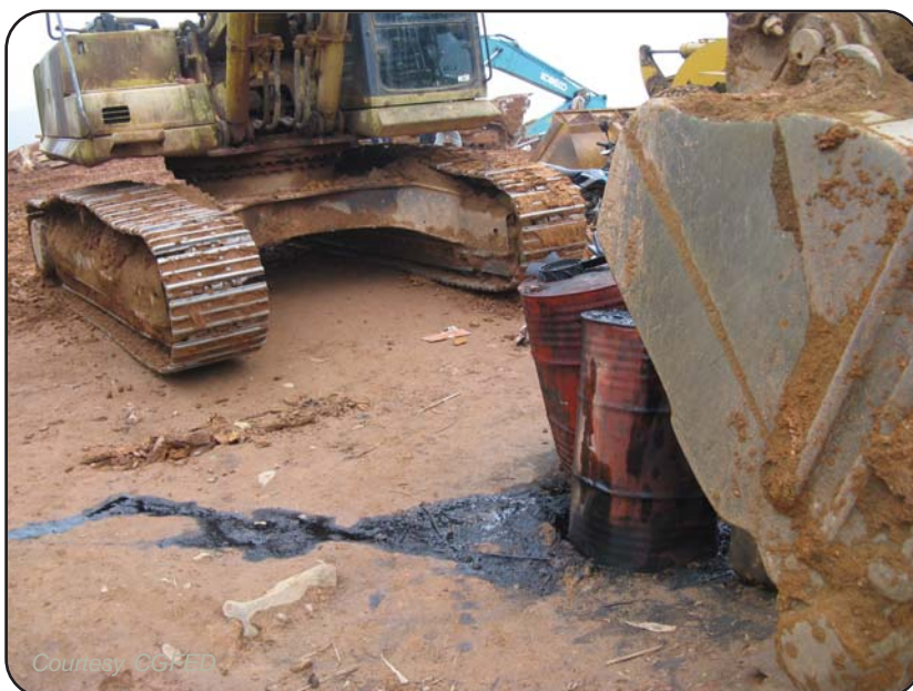
Mine site in Hung Think commune, Tran Yen district, Yen Bai province, Vietnam

Women also spoke of reduced access to water as a result of mining. In one of the communes, mining activities had destroyed the water supply and infrastructure and reduced the community's access to water.