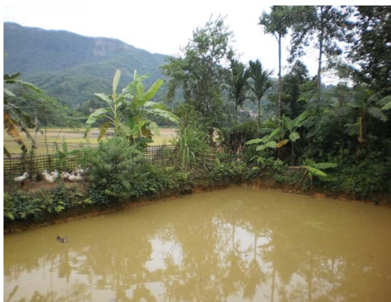
Kitchen gardens affected by iron ore dust pollution, Hung Thinh commune, Yen Bai district, Vietnam

Thus the women complained that the absence of women being represented adequately in the committees and councils with very few holding leadership positions also adds to the non-representation of gender concerns when granting licenses.