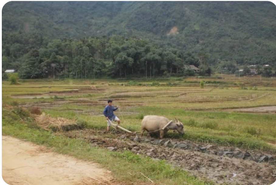
Rich natural resources and farmlands in indigenous people's area facing contamination from iron ore mining in Vietnam (Kim Binh village)

Women in all the mine sites in the three countries reported that the loss of land and access to forest had negative impacts on their livelihood and food security. In Mondulakiri and Ratnakiri provinces in Cambodia, indigenous women said that exploration activities led to destruction of forest resources, and some of their crops were damaged. They expressed anxiety over future threats to their forest resources, livestock and incomes when the mining