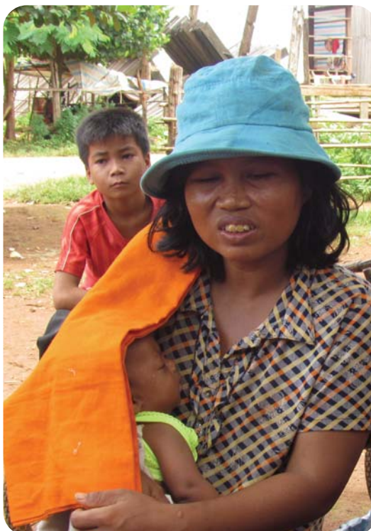
Migrant mine worker describes her life in the mines

The Constitution of the country and the Land Law provide protection to the indigenous people, and the National Policy on the Development of Indigenous Peoples adopted in April 2009 upholds provisions of Mining and Land Laws for ensuring proper relocation, encouraging mining companies to build schools and hospitals for indigenous people, and to provide them with jobs and training that will allow them to gain employment in mining. At the international level Cambodia is a signatory to the UNDRIP, as well as other international covenants and conventions that protect indigenous peoples' land and resource rights (CCC 2010).