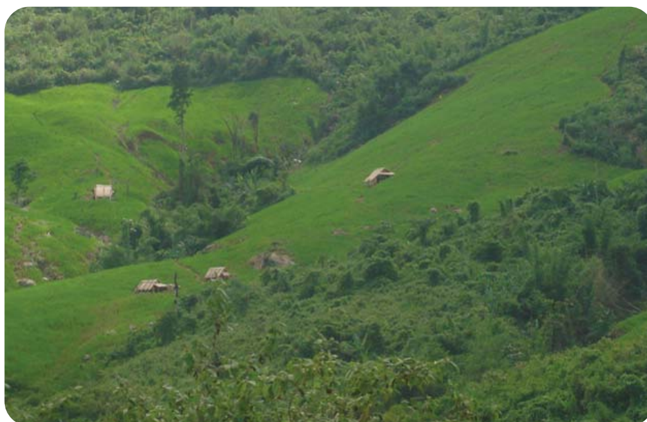
A biodiversity rich indigenous area in Vientiane province, Lao PDR

Field interviews in the three mine sites revealed that women who have previously contributed to household incomes by farming now must rely solely on their husbands' income from the mining project to support their families. Some of them said they fell into deep poverty as a result of losing land. Some of the women participants of focus group