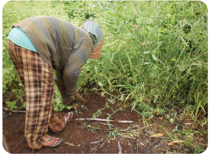
Traditional slash and burn cultivation in Mondulkiri province, Cambodia

Hence, it is important that companies approach mine employment with a gender parity policy where women should be enabled to access training and skills for equal opportunities not only as truck drivers, but in other technical sections as well. Yet, in Sepon and Phu Bia, there is a downward trend in hiring female workers which does not predict well for women. Besides, majority of women are on low paid unskilled contract work and many women who lost