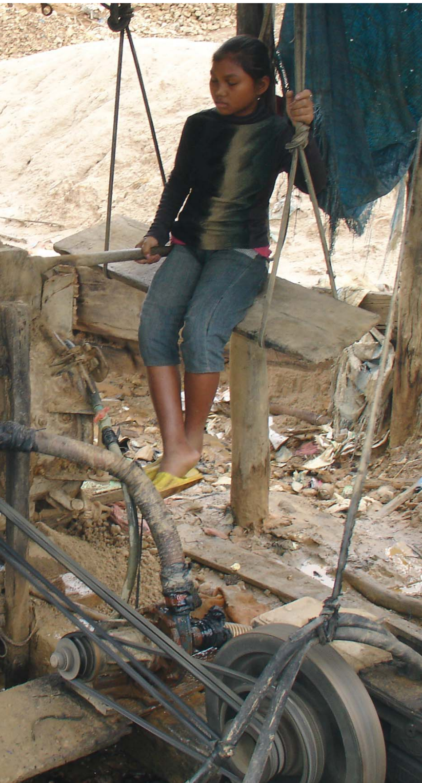
Child worker in the small-scale gold mines, Cambodia

of their land rights puts them at a much more vulnerable situation today with regard to women's land rights. The following section which details the socio-economic status and development indicators of women in Cambodia reveals the challenges that confront them vis-a-vis protection of their resources and social security in the context of the extractive industry.