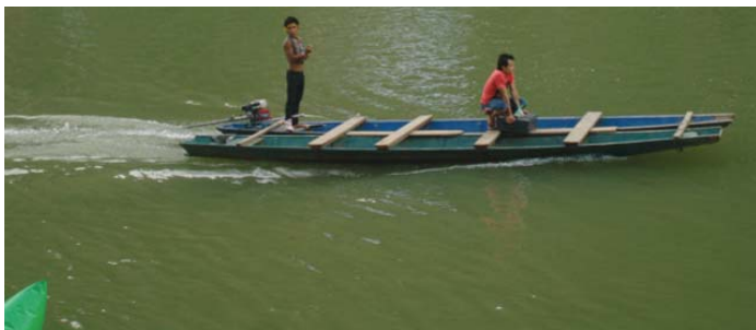
Nam Ngum, a tributary of the Mekong River faces ecological threat by proposed mining projects, Lao PDR

Lao Tai who form the dominant group in the country follow a matrilineal inheritance system where the land, whether agricultural or homestead, is inherited by the daughters. Owing to this system of the dominant group, Lao daughters make up the majority of those who inherit property. But the land titling process as shown above has led to women losing out land in their names rather than legally inheriting what is traditionally a practice. Lao PDR's inheritance laws for property and land are, however, gender neutral. These include the rights of inheritance and sharing of property under different legislations like the Family Law 1990, Inheritance Law 1990, Land Law 2003 and Property Law 1990 (ADB 2004).