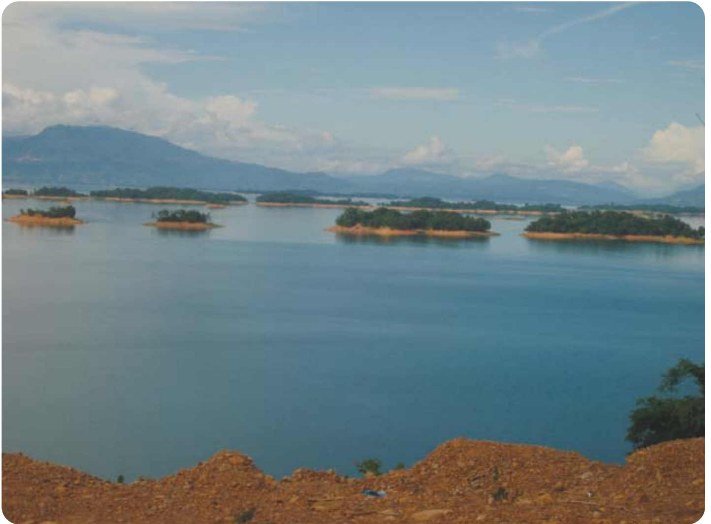
Nam Ngum River, A tributary of the Mekong - threatened by mining - the dam across the river built to provide hydel energy for major projects like mining, Lao PDR