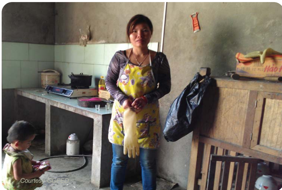
Women are hired mainly as cooks or other non technical activities in the mines. Hung Thinh commune, Tran Yen district, Yen Bai province, Vietnam

Women workers in the quarries are in charge of logistics for mining activities such as preparing meals, cleaning the work site, doing administrative or accounting works for which wages are lower. Even in the family-size quarries manual labour is used. Men are often responsible for important works such as exploding, laying stone strap, and transportation while women are in charge of collecting smaller rocks after mine explosion, loading stone into trucks, and supporting men in other works. Accordingly, the income of men and women is different with men's income being usually higher.