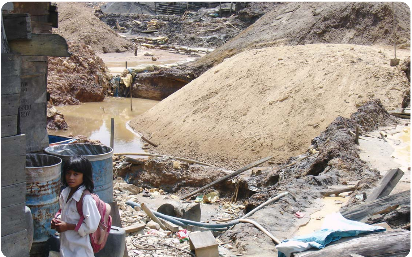
Small-scale gold mining in Chong Plas, Keosema district, Mondulkiri province, Cambodia- Migrant families live on the site

Most importantly, given the high numbers of women involved in ASM activities traditionally in all the three countries, the regional cooperation plan for mining as well as the national bodies involved in women's programmes should lay stress on the need for training, skills building and encouragement of women's cooperatives in strengthening their traditional mining rights. Given also the large indigenous/ethnic populations in the three countries, where traditional land and forest resources form the mainstay of livelihood, their demands for protecting their resource rights against large-scale industrialisation and mining projects should be respected. Consultation with these communities and particularly with indigenous women, and their right to exercise FPIC should form the backbone of any development planning. Foremost is the urgency to complete the land registration process with women getting formal and legal rights over their lands, properties and collective resources.