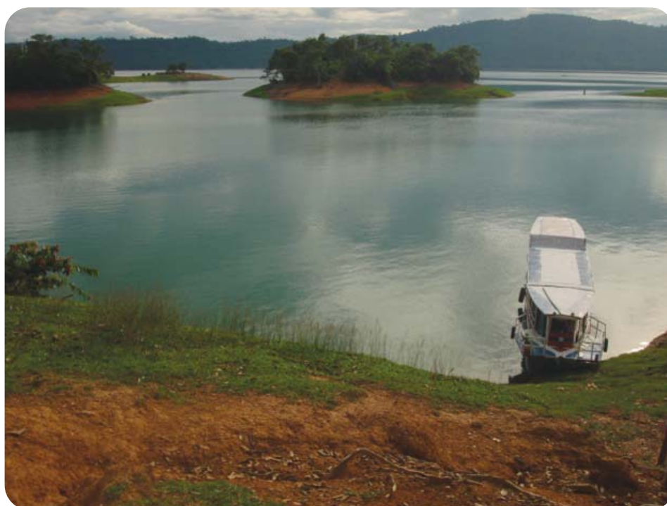
The Nam Ngum River- a source of livelihood for indigenous communities

Hence these gains and losses from mining sector operations in Lao PDR have to be weighed carefully vis-a-vis gender equality without making light of the impacts that mining operations have on women's lives. Future development programmes, land concessions for mining projects and expansion of its FDIs should significantly take into account the experiences of women from the mining areas.