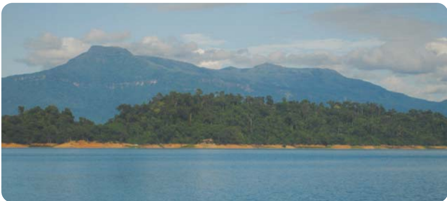
The far hills proposed for mining in Lao PDR

discussions stated that there were cases of women left with no support as the husband does not share the compensation money or incomes after getting the job in the mining, which has increased their workload and domestic responsibilities. The payment of compensation to men on behalf of families and communities had denied women access to and control over the financial benefits of mining and loss of land and natural resources for their self-sustenance. This has forced women's economic dependence on men, disempowering them, skewing gender relations or exacerbating existing inequalities. As one woman interviewee said,