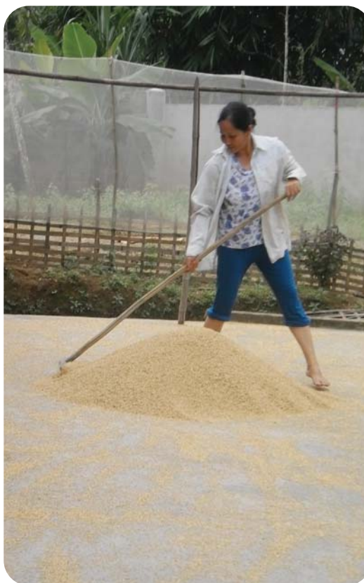
Indigenous woman whose village is affected by iron ore mining, Hung Thinh commune, Yen Bai district, Vietnam

They also complained of increase in domestic violence due to conflicts between the spouses on issues of migration, suspicions created by disrupted family life and the increased need for cash. The research participants referred to their own experiences of husbands suspecting their wives of being sex workers if the women have to migrate out of the village seasonally. Therefore, men find excuses to misuse the earnings they perceive as 'dirty money' of the wives by gambling, consuming alcohol and physically abusing them. In some cases, as a result of losing agriculture land, men cannot find alternate work and the women complained that some of the men became lazy and unproductive. This is