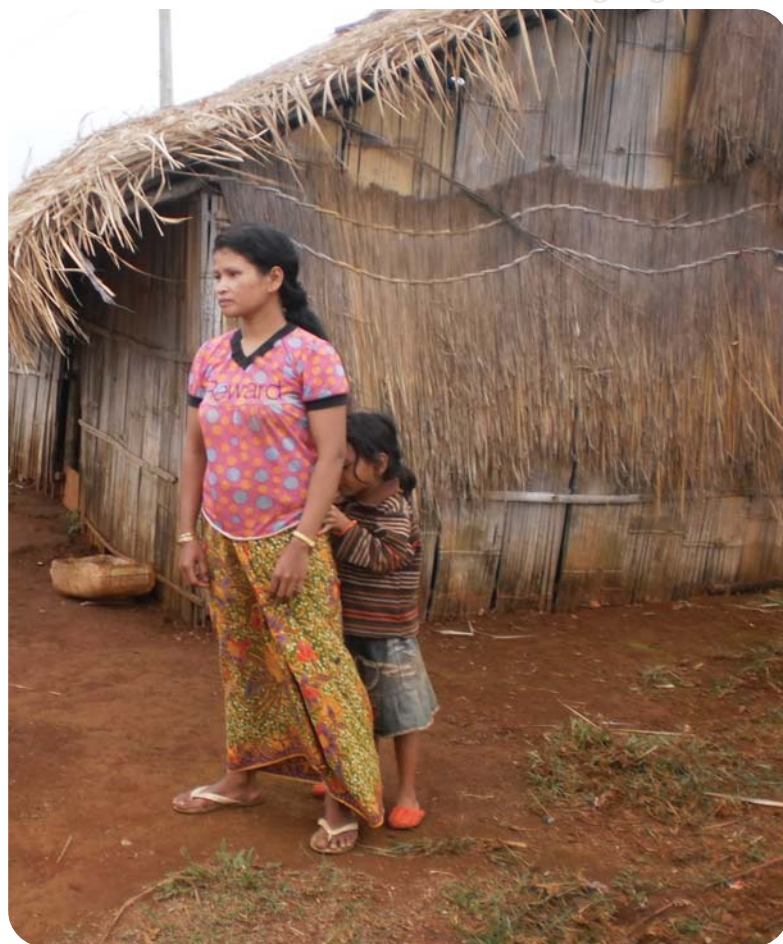
Indigenous woman from Pu Tang village, bauxite mining area in Mondulkiri, Cambodia had serious concerns about the exploration activities in their lands

Women and men in Cambodia have equal legal rights to land with women owning land. Property inherited by women can be registered in her name only, while land obtained during marriage is common property and needs to be jointly registered. However, cultural prejudices and social pressures prevent women from registering property they bring into the marriage in their own name for fear of offending the husband. These are compounded by practical obstacles