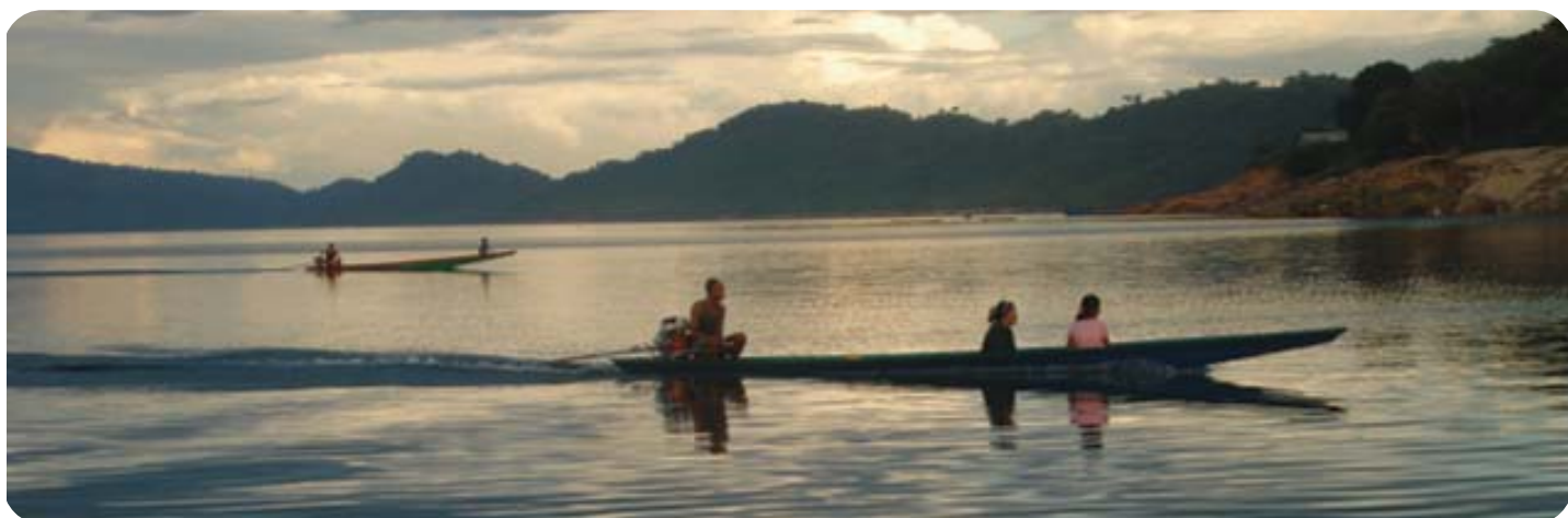
Traditional fishing in Vientiane province impacted by water contamination due to mining upstream, Lao PDR

Dust from the mine sites was another main cause for concern. Even women and children who are not working in the mines are constantly exposed to various respiratory illnesses due to inhalation of dust particles, skin diseases, and malfunctioning of various sensory organs, were experienced. The women stated that they were compelled to expose themselves and their children to severe health risks, especially posing hazards to pregnant women. The most common diseases reported by people from the mining area are cough and cold, malaria, skin diseases, diarrhoea and other respiratory illnesses. Environmental degradation has undermined women's capacity to provide food and clean water for their families, and subsequently led to an increase in their workload such as having to walk greater distances to access water, fuelwood, forest products and land for cultivation. There is no clear information regarding environmental studies or assessment conducted in Sepon as per the environmental guidelines although some reports of baseline surveys conducted exist (Shingu 2006).