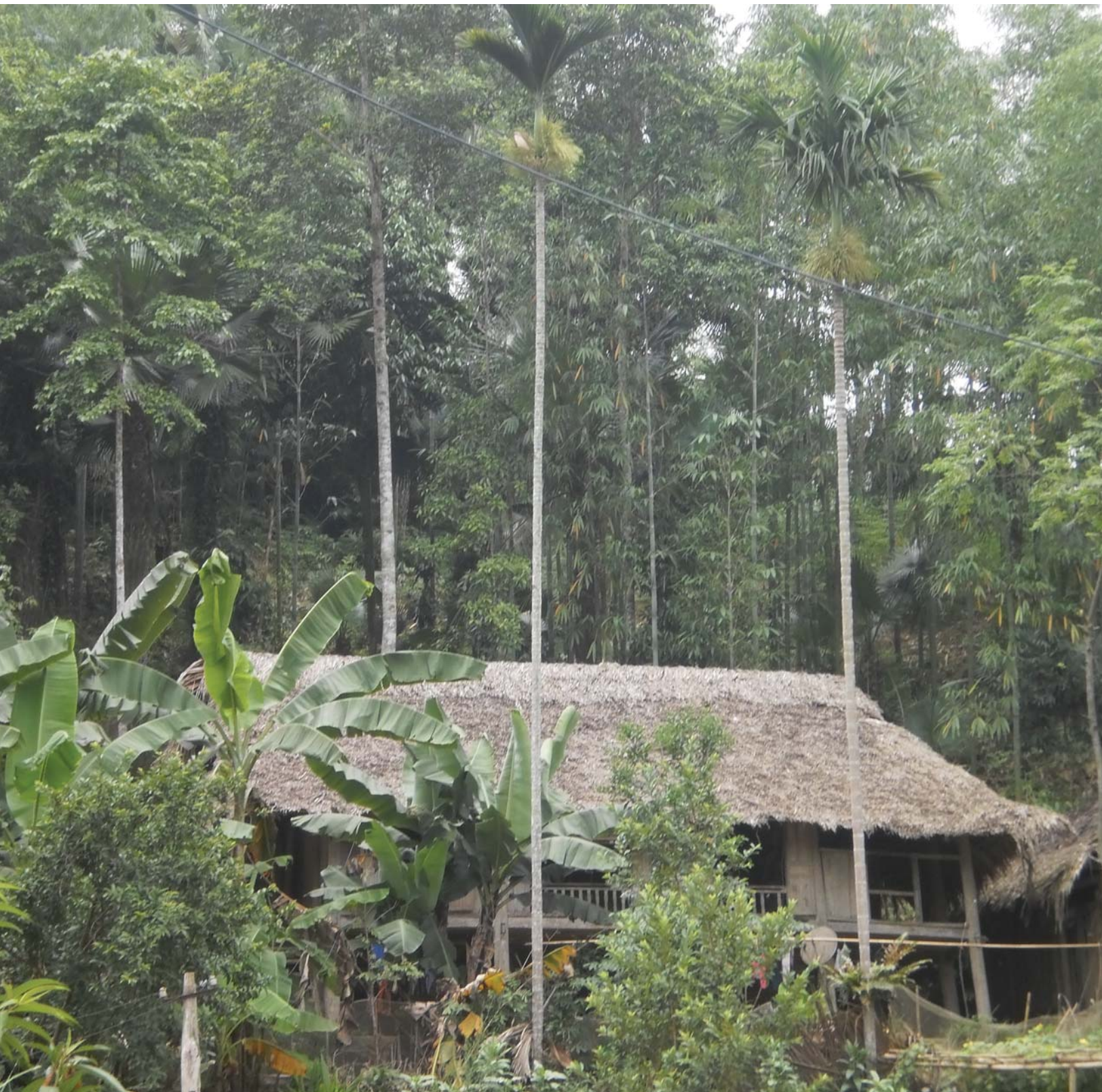
Kim Binh village is home to an indigenous community-Dust and water contamination experienced by community since the last 5 years of iron ore mining, Vietnam