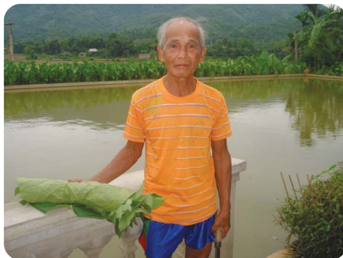
Indigenous elder talks of iron ore dust affecting their homestead farms and vegetables, Hung Thinh commune, Yen Bai district, Vietnam

(Iron ore mine, Hung Thinh commune, Tran Yen district, Yen Bai province)