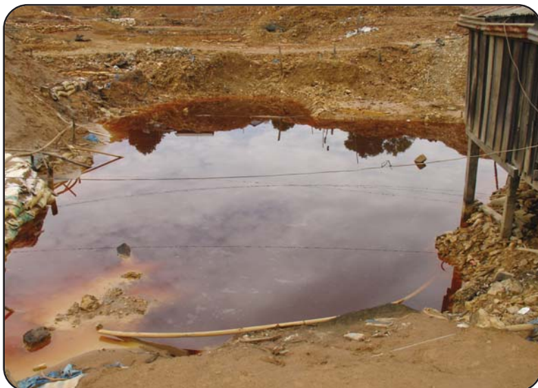
Toxic chemicals mixed with water used for refining gold, Cambodia

Given the above framework of law and policy with respect to gender equality in Cambodia, the study presents the field dynamics that influence gender relations in the context of the extractive industry.