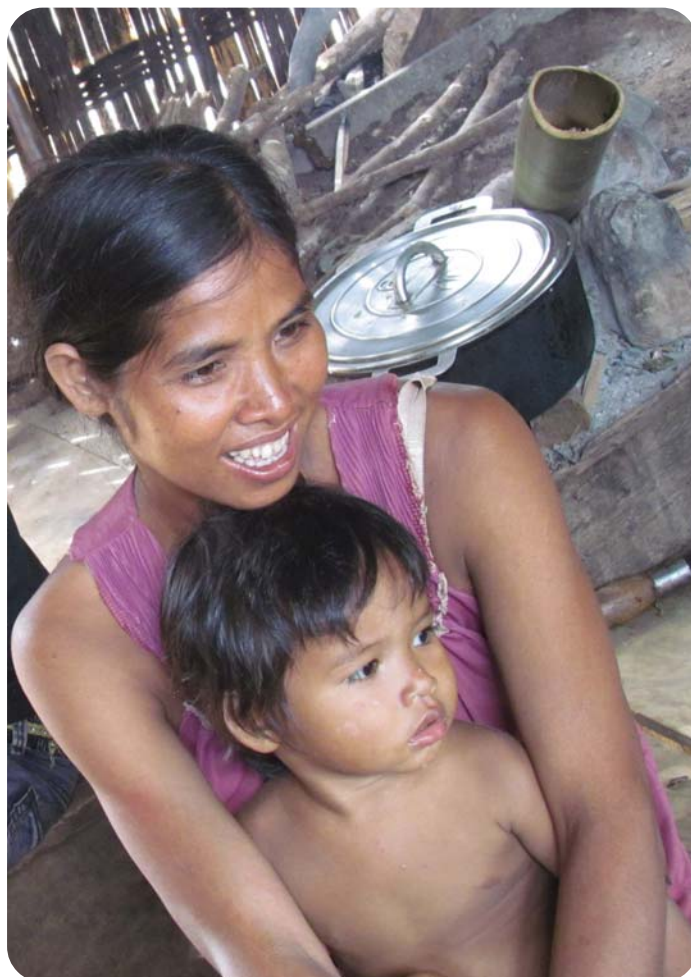
Indigenous woman being interviewed on impacts of mining in her village, Mondulkiri, Cambodia

In terms of ownership, the Cambodia Demographic and Health Survey 2005 indicates that 60% of women own land alone or jointly, while only 14% own land alone and of this only 65% can sell it without permission. The proportion of