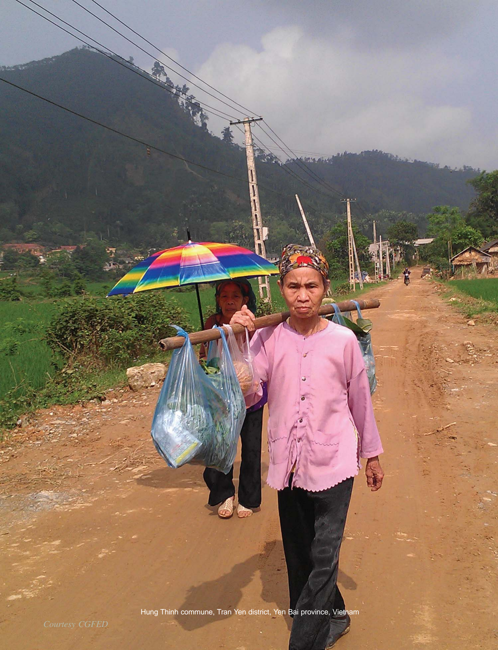
Hung Thinh commune, Tran Yen district, Yen Bai province, Vietnam