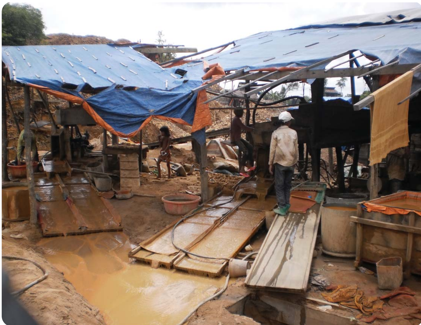
Small-scale gold mining in Putong, Chong Plas commune, Mondulakiri province, Cambodia

The Hoang Anh Rattanakiri Co Ltd., was granted an exploratory license over 4000 ha around Karchark village. It employs 50 workers in the village of which 20 are from the indigenous community. Most of the workers earn Riel 20000 per day with the more skilled getting Riel 100000 per month apart from food provided by the company. The company