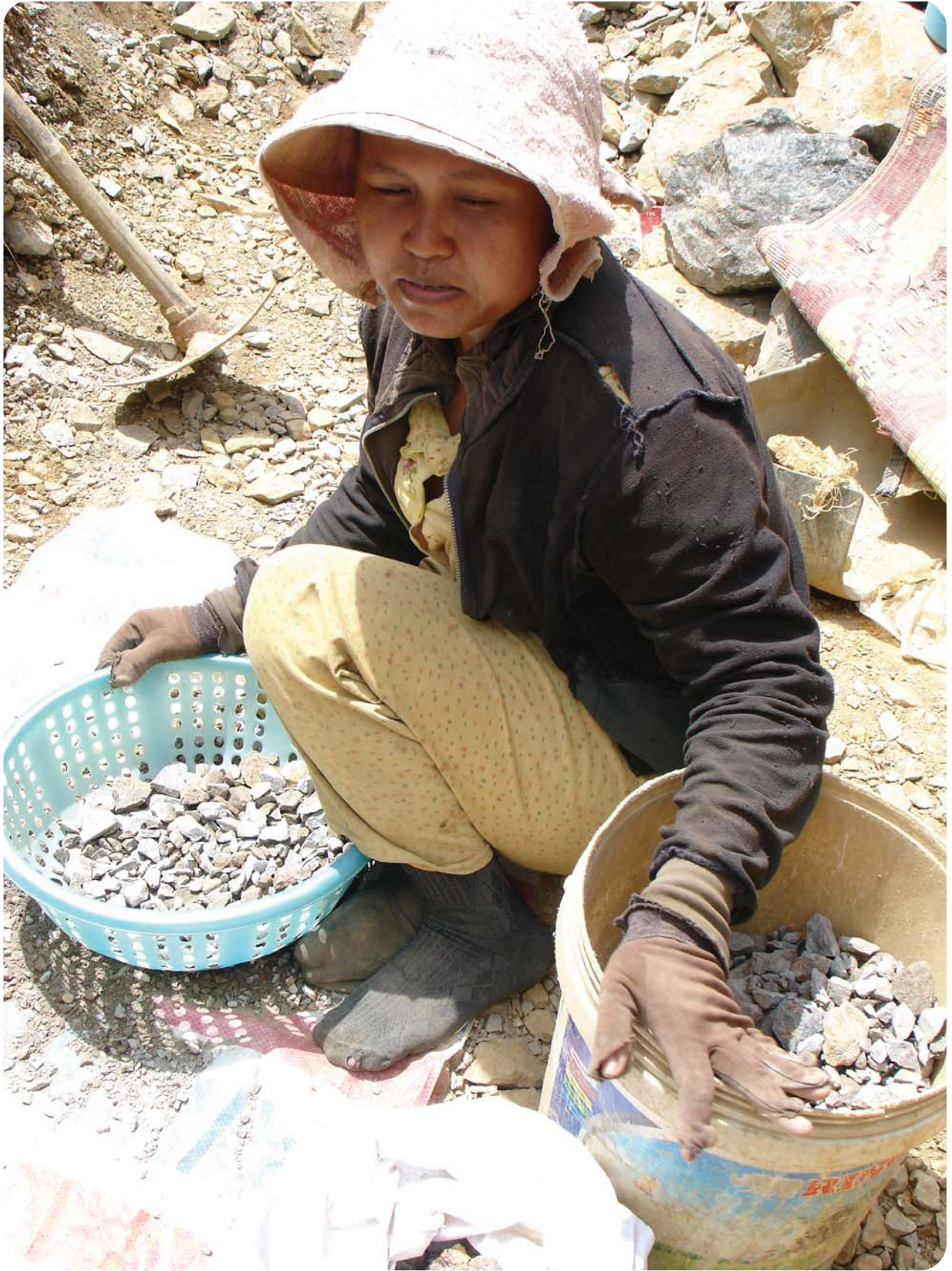
Artisanal woman miner in Chong Plas gold mining area, Cambodia