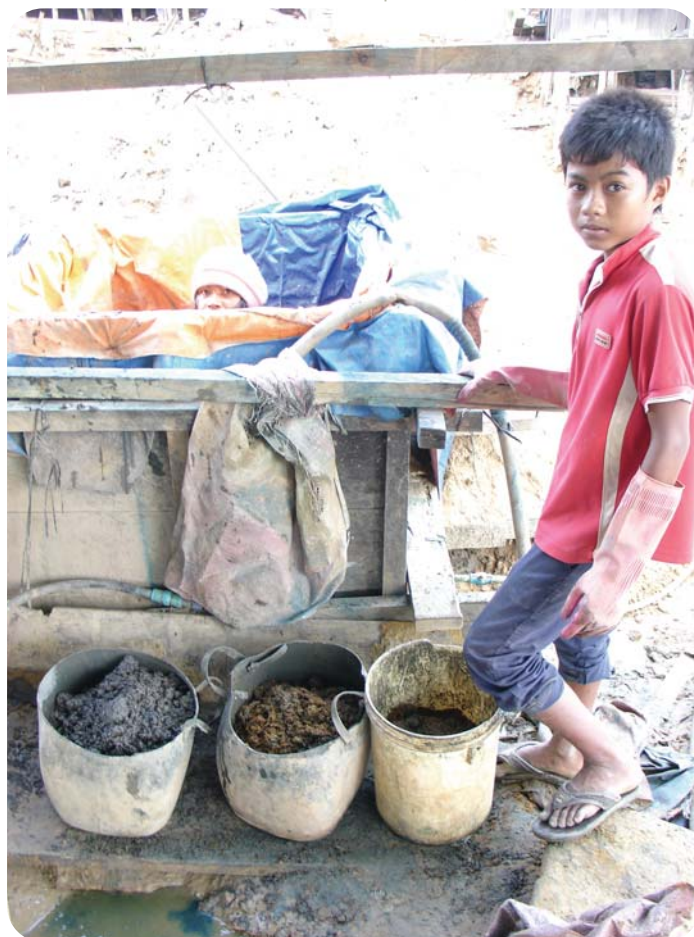
A young boy as migrant labourer in the gold mines, Putong, Chong Plas commune, Mondulakiri province, Cambodia