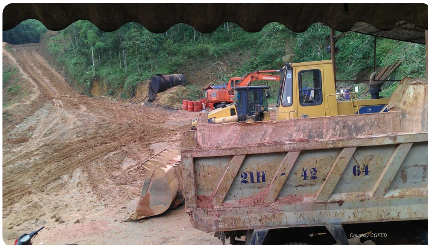
View of the mine in Hung Thinh commune, Tran Yen district, Yen Bai province, Vietnam

The field research sites in the iron ore mines reflects this hasty manner of sanctioning licenses without due consultation of local communities, or sufficiently providing formal space for important local bodies like the VWUs before granting mining leases. Only the Fatherland Front at the grassroots level was heard of being consulted. With respect to ethnic minorities, there is lack of clarity in Vietnam as in Lao PDR regarding their Constitutional status as they are not recognised as indigenous people. However, being a signatory to the UNDRIP, Vietnam has committed to respect