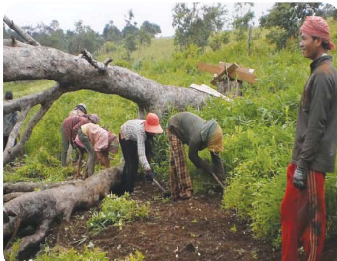
Proposed bauxite mining area with sample pits in indigenous people's slash and burn farmlands, Mondulkiri, Cambodia

The government has granted several ELCs in indigenous areas to private companies for leases of 99 years. According to a report by the NGO Forum in 2008, nine large-scale leases extending to 10000 ha and several smaller concessions covering an area of 1000 ha have been awarded. In none of these were the indigenous people consulted prior to grant of leases (UNCOHCHR 2007). The protection provided under the Land Law 2001 has not been sufficient to protect communities against the powerful interests of the State and markets. Land titles for indigenous