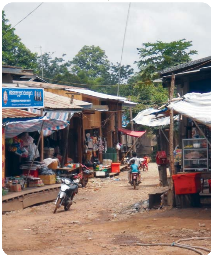
Non-indigenous settlers take over an indigenous area for gold mining activities, Mondulakiri province, Cambodia