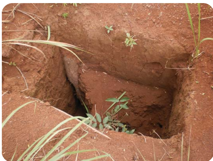
Holes dug to collect sample ore left unfilled posing a hazard to humans and domestic animals, Pu Tang village, Senmonorom district, Monduliri province, Cambodia

Interviews with affected indigenous community revealed that earlier a Korean company had taken their lands without their permission for exploration of gem stones. This had angered the community as their access to the forest was disrupted and there were holes drilled into their lands without being informed. Since artisanal mining is indiscriminate and uncontrolled without any precautions to the environment or health of the people, the local communities and the mine workers themselves placed several demands during the focus group discussion. For the workers, these were mainly around the need for government to intervene and give proper technical training for mine extraction, providing proper tools and skills for extraction and processing, proper demarcation of lands for mining activities based on strict licenses and proper facilities for working and residence of the mine workers. The local community emphasised that the process of communal land titling has to be first completed with rights of indigenous communities to their land and forest recognised. They want to decide whether they would like to practice farming or give certain amount of land for mining concessions, but for this, they demand that their due consultation is made mandatory by the government, in order to protect their own land rights.