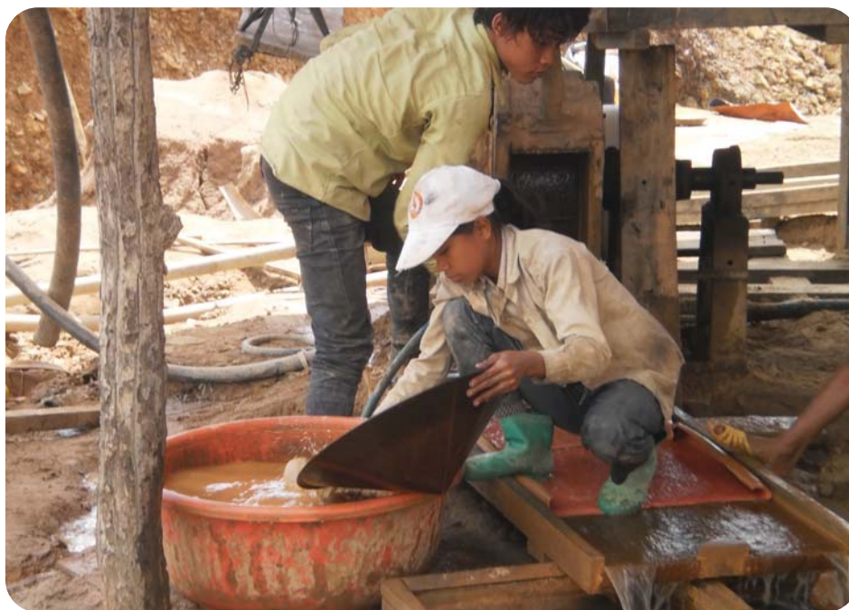
Chong Plas mines (Cambodia): Children perform several tasks in the mine site from a very young age