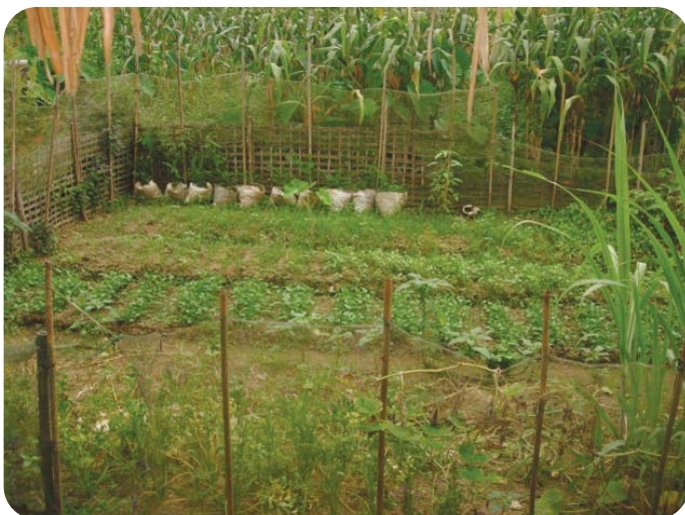
Kitchen gardens affected by iron ore dust pollution, Hung Thinh commune, Yen Bai district, Vietnam

(Limestone mine, Hong Linh town, Ha Tinh province)