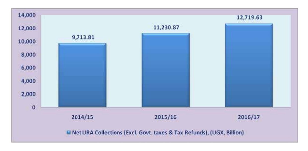
Figure 1: Total URA Tax Collections 2014/15-2016/17