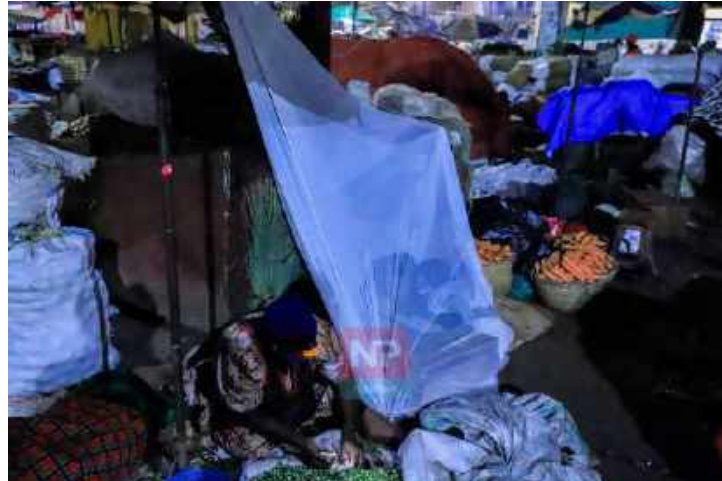
Women traders sleeping in markets in Uganda